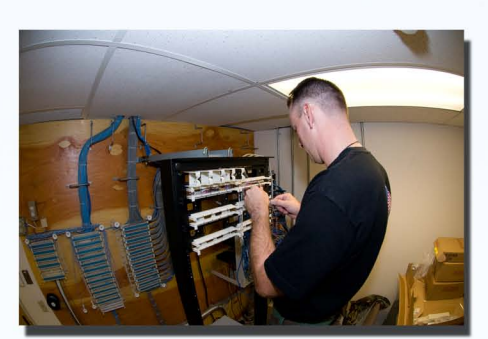
141st members took the lead for the client management process across Fairchild Air Force Base during Total Force Integration moves.