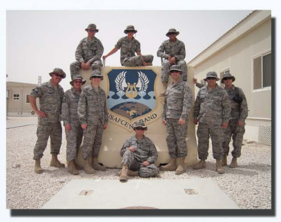
The Band of the Northwest performed 21 concerts in Iraq, Kuwait, Qatar and Afghanistan. Audiences consisted from 50-350 military members. Over 6,000 troops were entertained.