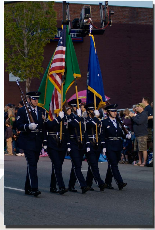
The 141st Honor Guard represented the Wing and National Guard at 59 ceremonies.