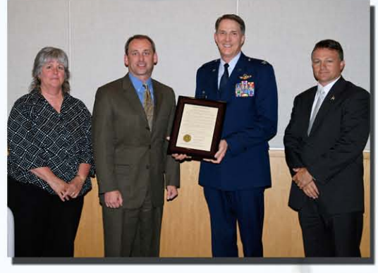
Spokane County Commissioners proclaim the month of August as Air National Guard month.