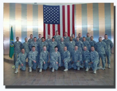
Security Forces spent the holidays in Iraq while deployed for six months.