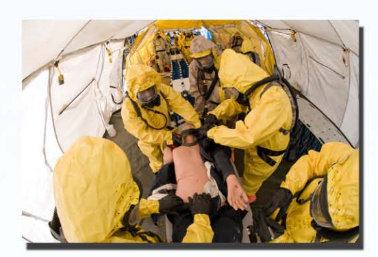
Volunteer CERF members participated in exercises while preparing for support of the 2010 Winter Olympics.