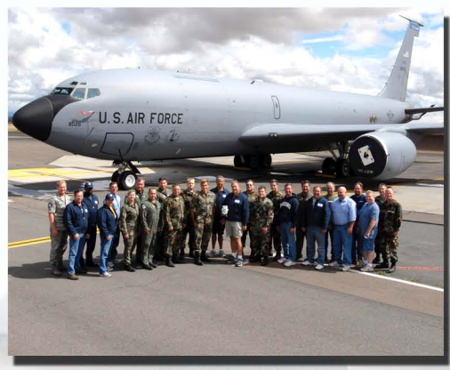
Performed Control Column Actuated Brake modifications on 49 aircraft with 87 percent finishing on time or ahead of schedule.