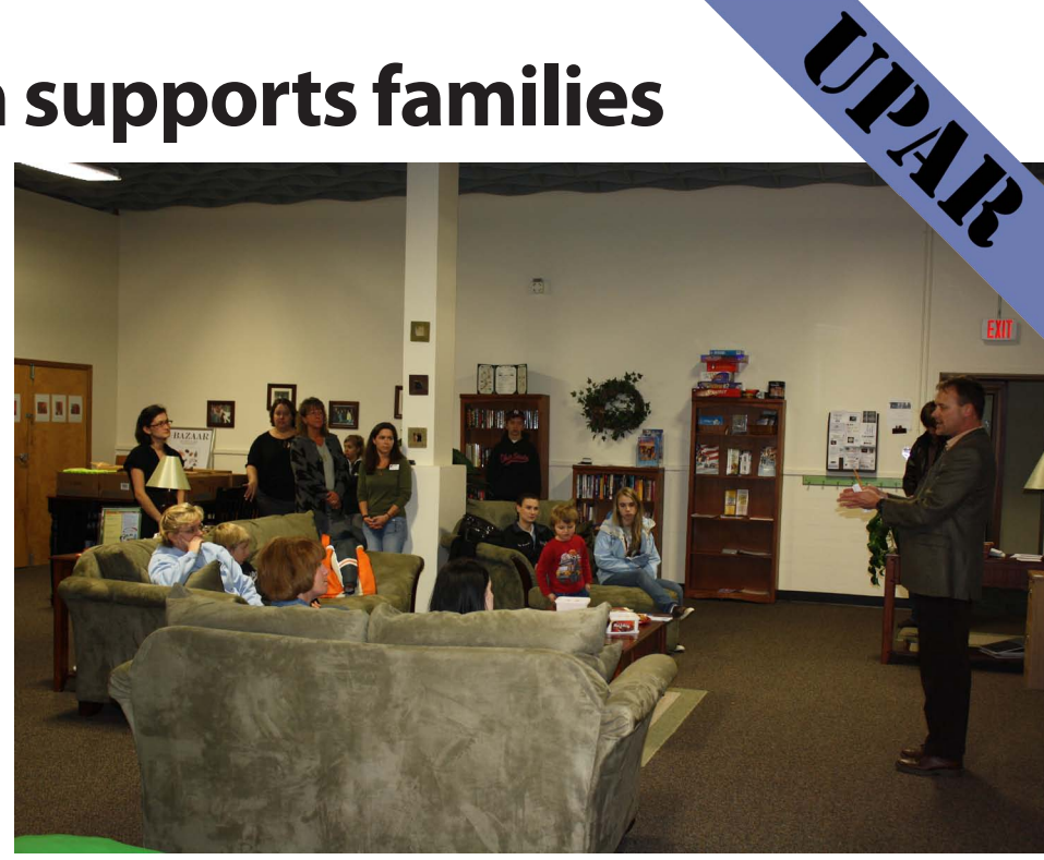
Family members of deployed security forces meet together to receive helpful information from local community organizers.

The highlight of the evening was provided