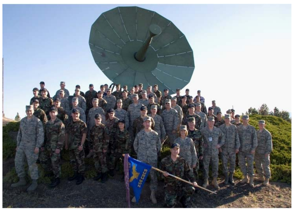
256th CBCS members stand in front of a satellite communications dish at former location near Four Lakes Cheney.

change of command, career field changes and pushed up deadlines for a major move, 256th CBCS personnel have made each day count