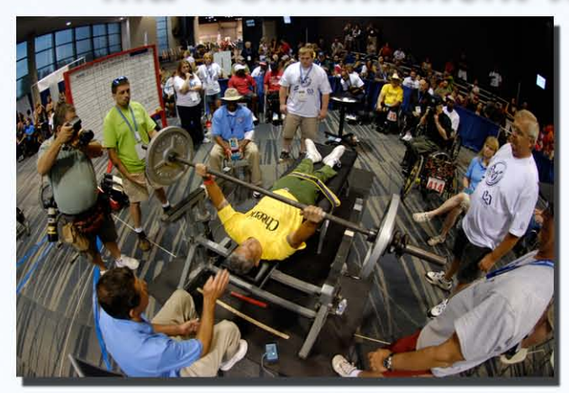
Wing volunteers played a key role during the 29th National Veterans Wheelchair Games held in Spokane in July ensuring the safety of over 500 athletes.