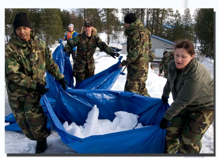
During a Washington State emergency, Air National Guard members cleared more than 80 miles of roadways in less than two weeks.