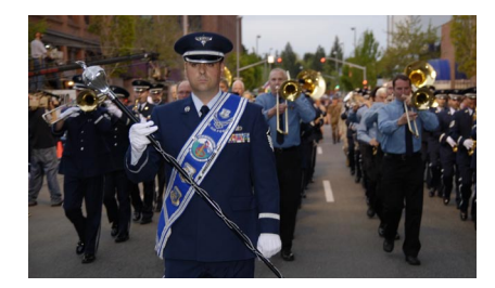
The Air National Guard Band of the Northwest marches with retired members who returned for the 85th Anniversary celebration.