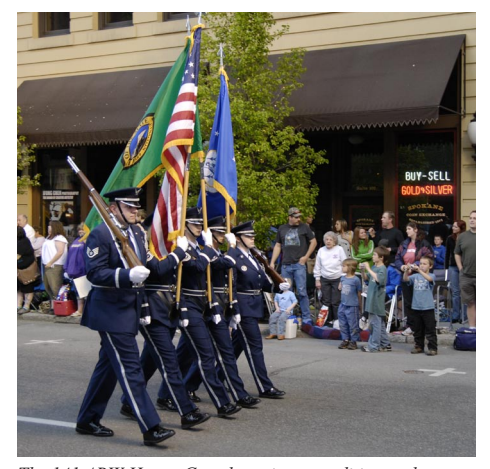
The 141 ARW Honor Guard continues tradition and serves as a highlight for Guard representation.

<sup>1</sup> Various military bands marched and performed patriotic tunes. The Air National Guard Band of the Northwest, which has marched in 42 consecutive Lilac parades, performed once again. Joining them was the special reunion band, which included retired members who returned to march in this 85th Anniversary celebration.