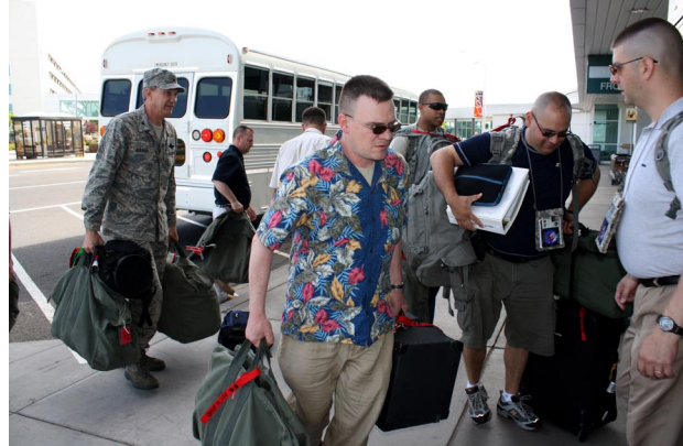
(Above) The 560th Band gathers up luggage and equipment for their deployment.